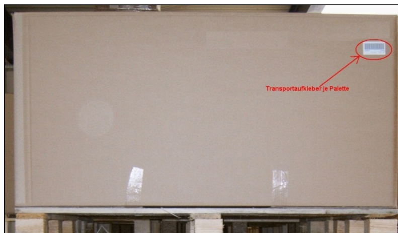
Figure 1: example of an overpackage with PLX article number and barcode