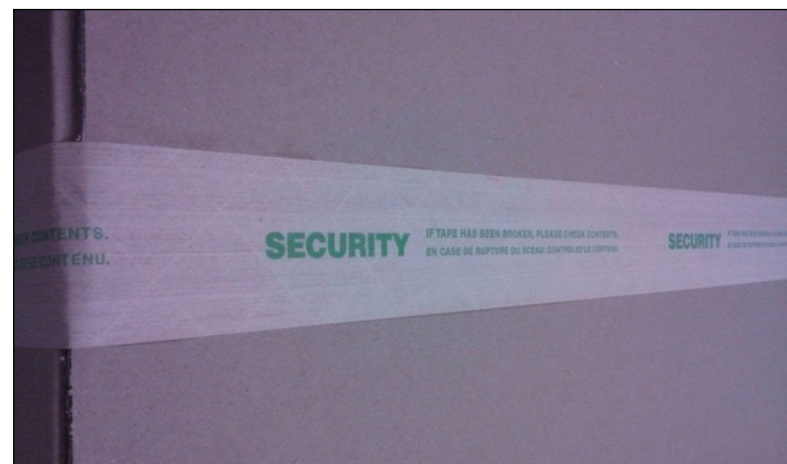
Figure 2: transport packaging secured with soda wet tape