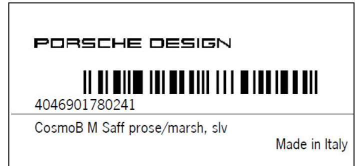
Figure 6: example product label Porsche Design