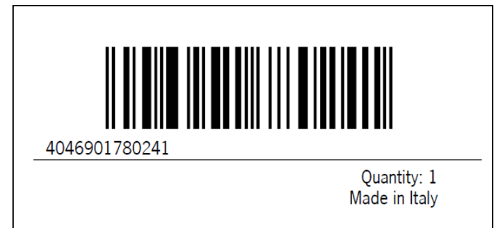
Figure 7: example transport label Porsche Design

* RN- and CA- numbers for relevant products