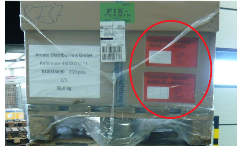
Figure 10: Delivery note on transport package