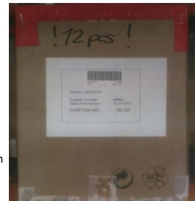
Figure 9: Identification of max capacity not reached