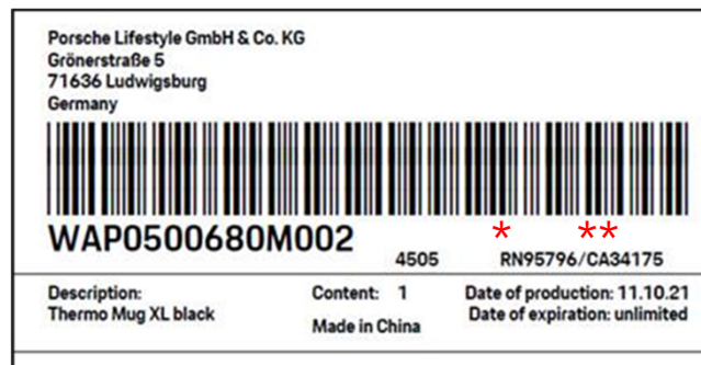
Figure 4: example product label Porsche Lifestyle