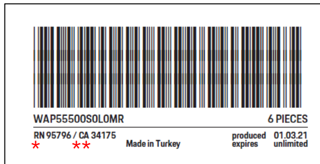
Figure 5: example transport label Porsche Lifestyle