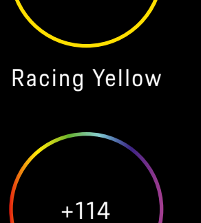
Paint to Sample