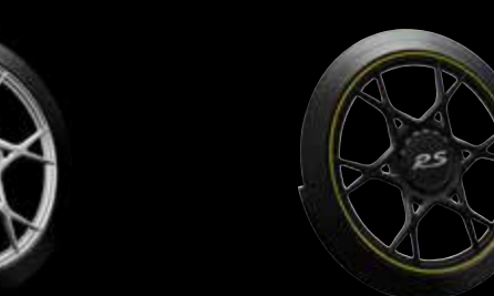
Black with colored ring in Racing Yellow