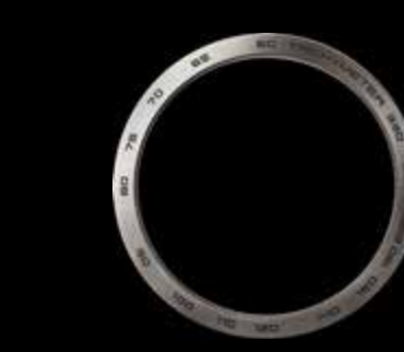
Natural titanium, tachymeter