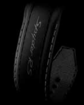
Black leather, stitching in Carmine Red