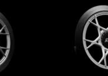
Brilliant Silver Satin Aluminum