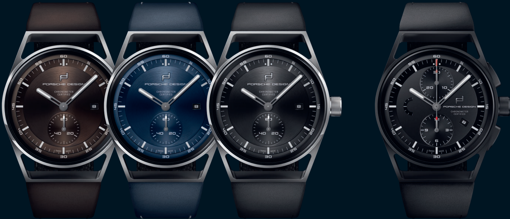
SPORT CHRONO SUBSECOND TITANIUM & BROWN

With the Subsecond timepiece, for the first time in the history of Porsche Design, a timepiece is being released in two different case sizes: the familiar 42 mm version, and a new 39mm version.