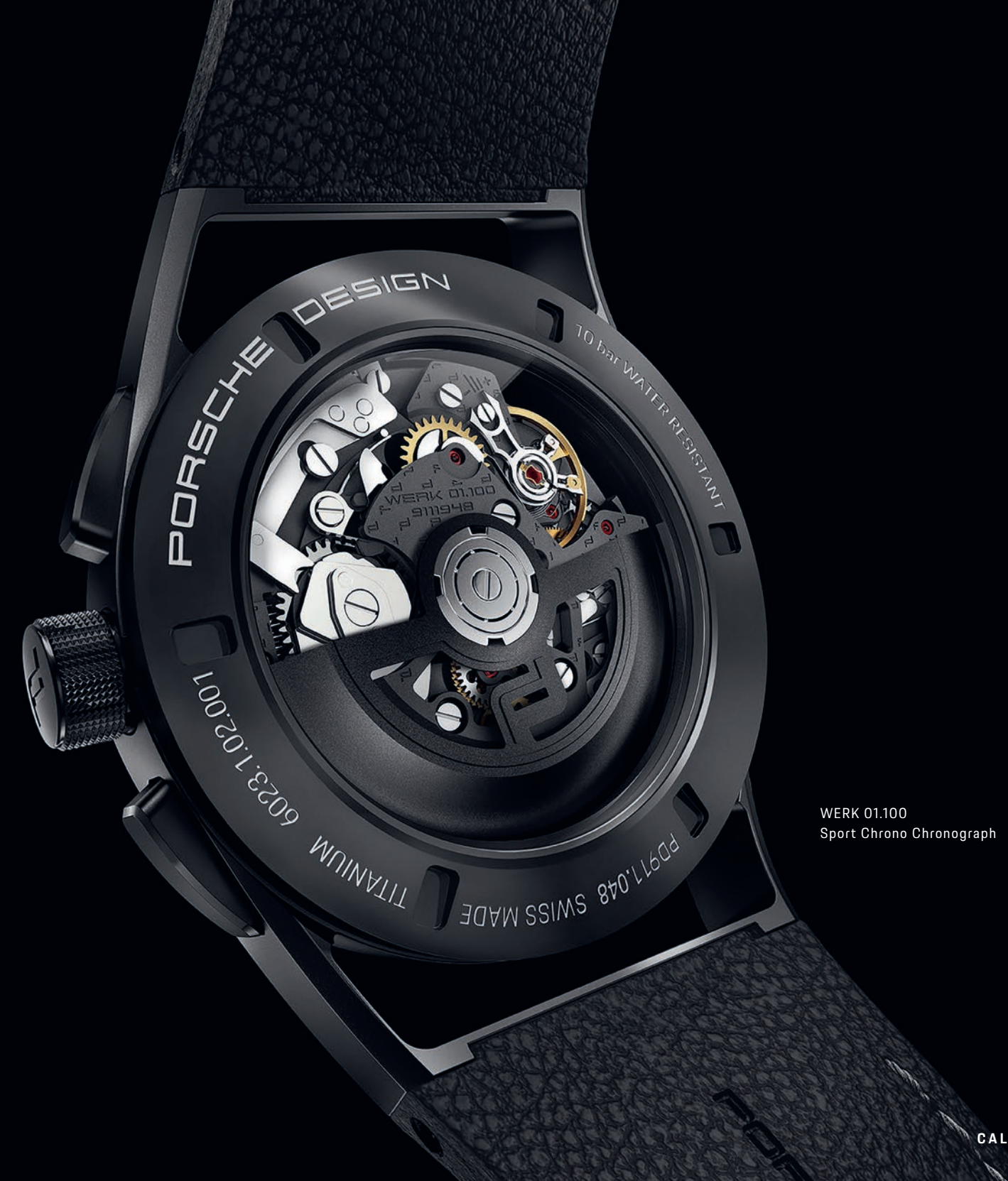
WERK 01.100 Sport Chrono Chronograph

combination of attention to detail and technical expertise. This perfect symbiosis has been translated into high-quality timepieces in Solothurn since 2014 – at Porsche Design's own watch manufactory, Porsche Design Timepieces AG. There, engineers and watchmakers work side by side to ensure maximum performance out of each model. To make each design even more timeless. And to bring the accustomed Porsche quality not only into vehicles, but also to wristwatches. Bringing an entirely new kind of value to every second.