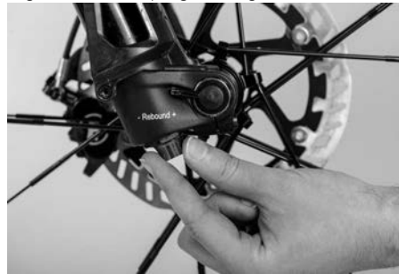
Figure 44: Damping setting

Too little damping will cause the fork to rebound very quickly. Too much damping will cause the suspension fork to bottom out during rapid consecutive impacts, because it can no longer rebound quickly enough.