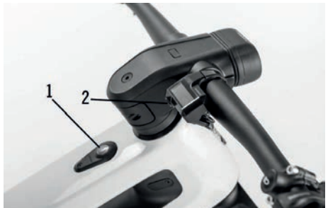
Figure 5: On/off button (1) and display button (2)

When the eBike is stationary, pressing and holding the display button (2) for around two seconds allows you to access the settings menu and select items from the menu.