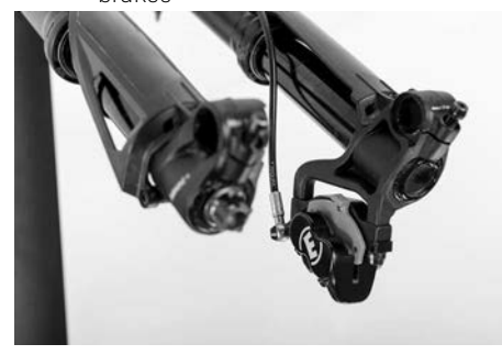
Figure 64: Transport guard for the disc brakes

Risk of damage to the eBike (brakes, rear triangle and front wheel fork) when transporting it with the wheels removed. Fit the transport guards for the disc brake. Do not operate the brake lever. Fit the spacers for the rear triangle and front wheel fork.