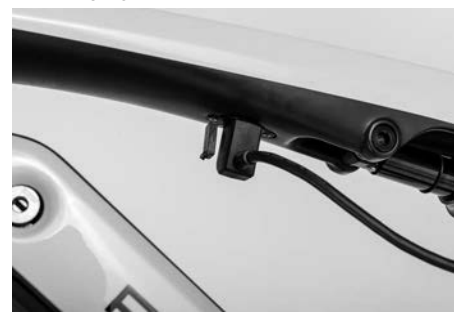
Figure 27: Charger cable in the correct po- Figure 28: Charging socket sition

The charging process starts automatically. The charge status display flashes to indicate that the battery is being charged. The LED on the charger lights up to show that the charging process is under way.