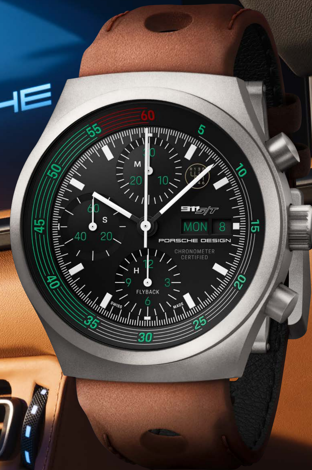
Chronograph 1 – 911 S/T Heritage