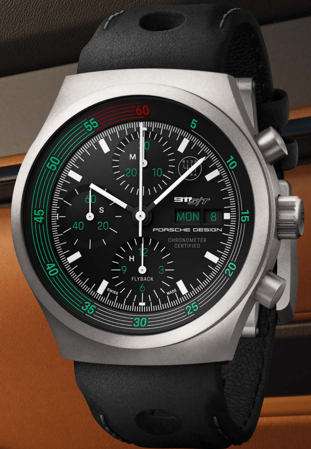
Chronograph 1 – 911 S/T